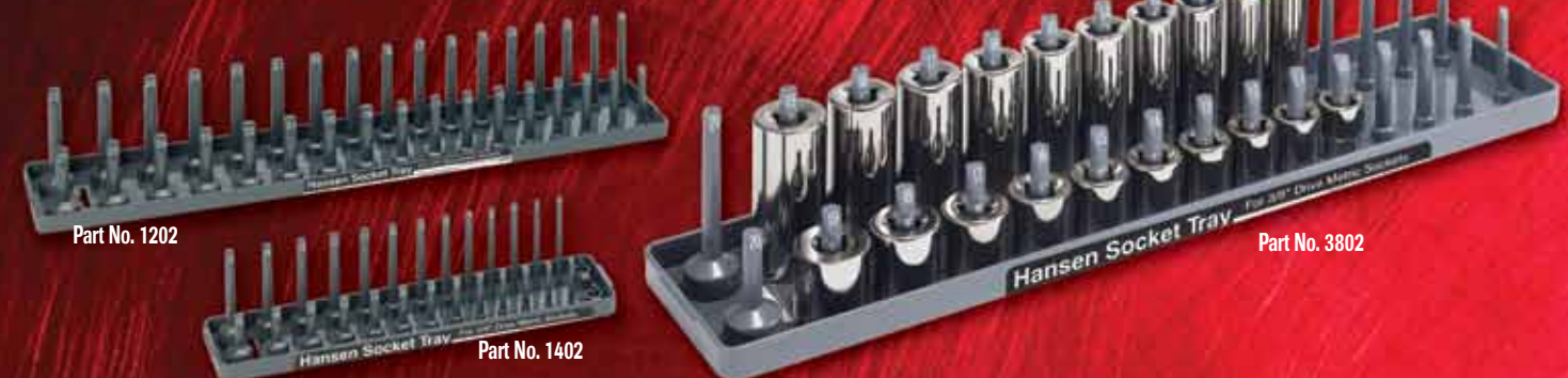
Part No. 1202

Part No. 1402 (supercedes Part No. 14200) 1/4" Drive, Regular and Deep Well 4, 4.5, 5, 5.5, 6, 7, 8, 9, 10, 11, 12, 13, 14 & 15mm