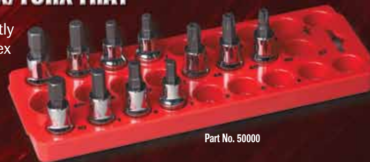
Part No. 50000

Tray is molded of tough ABS plastic to resist oil, grease and solvents. Sizes for each of the SAE, Metric and Torx sockets are pad printed in an oil and grease resistant black ink. Special end tangs on the 9-3/16" x 3-1/4" tray provide a finger hold for picking up tray in tight tool boxes.