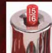
3/8" drive SAE tray features 15/16" posts for regular and deep well sockets

Butterfly-type slot on bottom for pegboard display.