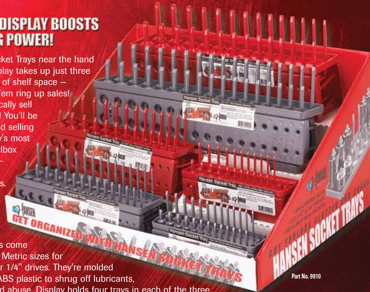
Part No. 9910

Display Socket Trays near the hand tools – display takes up just three square feet of shelf space – and watch 'em ring up sales! They practically sell themselves! You'll be showing and selling the industry's most popular toolbox accessory – Hansen Socket Trays.