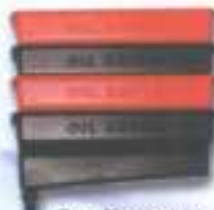
Part No. 69001 Oil Saver, Red