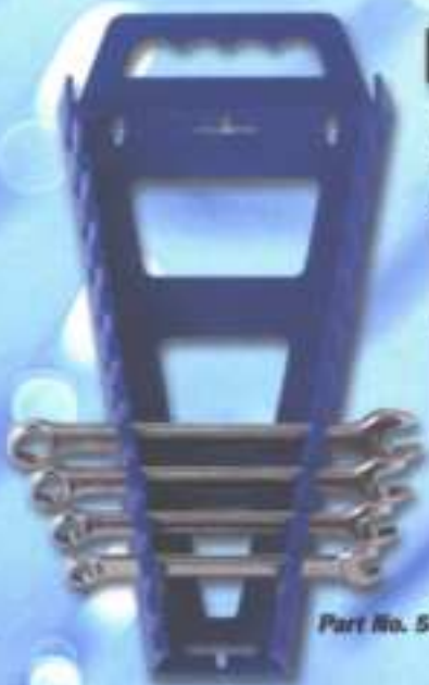
Part No. 5300

Tough polypropylene rack has 13 pairs of wrench slots and comes with two sets of peel-off labels; one in Metric sizes 6mm through 20mm and the other in SAE sizes, 1/8-inch through 1-inch. Wrench Racks can even be customized by combining Metric and SAE sizes. Spring tabs can also be trimmed to custom fit extra thick wrenches.