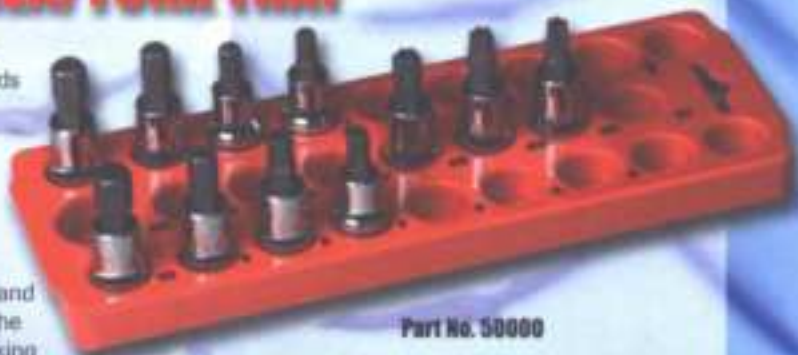
Part No. 50000

Tray is molded of tough ABS plastic to resist oil, grease and solvents. Sizes for each of the SAE, Metric and Torx sockets are pad printed in an oil and grease resistant black ink. Special end tangs on the 9-3/16" x 3-1/4" tray provide a finger hold for picking up tray in tight tool boxes.