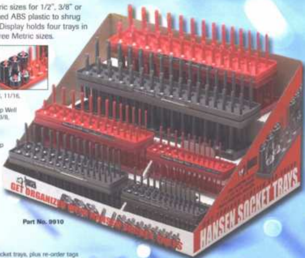
Part No. 9910