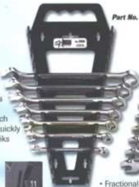
Part No. 5100

Holds 6, 7, 8, 9, 10, 11, 12, 13, 14, 15, 16, 17 and 18mm sizes.