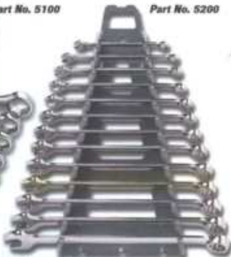
Part No. 5200